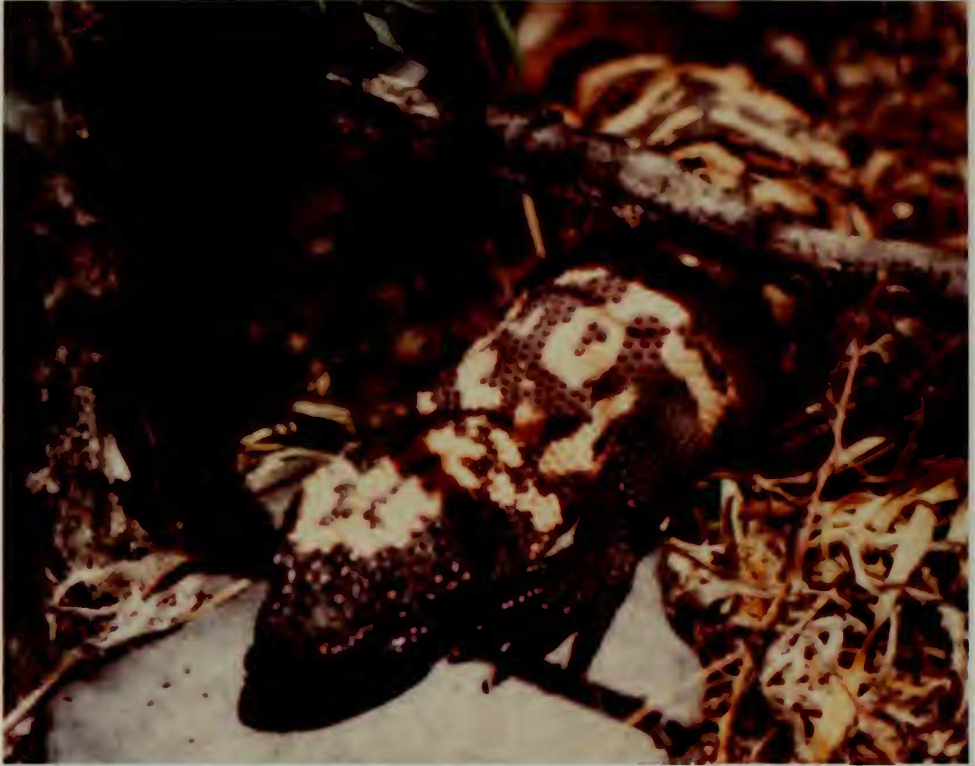
Fig. 4. The Gila monster from Piute Springs (see caption of Figure 3) in riparian streambed. Photo by Ann or Rachel Curren. LACMPC #1364c.

litt. ). When observed, it was in a streambed among vegetation and surface litter. The temperature at the time was 18.3° C under sunny, mostly clear skies with winds of 8–16 kph. It had rained “several” days prior to the observation. The elevation at the site is 853 m. Piute Creek is the only perennial stream for many kilometers around and is characterized by typical desert riparian plant species including Salix sp., Baccharis viminea , Prosopis sp., and Tamarix ramosissima . A subsequent herpetological survey of the site did not detect Gila monsters (Hazard and Rotenberry 1996).